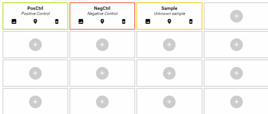
Fig 1. Cartridge set-up

An example of cartridge set-up on the bAPP for one replicate of a sample to be analyzed is shown.