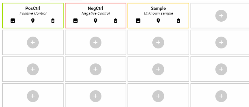
Fig. 1. Cartridge set-up

An example of cartridge set-up on the bAPP for one replicate of a sample to be analyzed is shown.