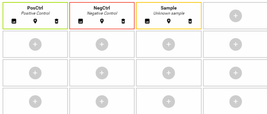
Fig 1. Cartridge set-up

The Kits may require the use of Taq Polymerase enzyme, DNA binding components and fluorochromes/quencher, often registered as trademark by companies. TagMan® is a trademark of Roche Molecular Systems, Inc. FAM™, HEX™ and ROX™ are a trademark of Thermo Fisher Scientific or its subsidiaries. SYBR is a registered trademark of Molecular Probes, Inc. (Thermo Fisher Scientific). MGB probes are a trademark of Elitech group. The Kits have been internally tested by our quality control. Any responsibility is waived if the warranty of quality control does not refer to the specific Kits. The user is personally responsible for data that he/she will obtain and/or he/she will supply to third parties using these kits. Once the sealed package is opened the user accepts all the conditions without fail; if the package is still sealed the kit can be returned and the user can be refunded. Kits components are intended, developed, designed, and sold for Research Purpose Only. Product claims are subject to change. Therefore, please refer to our website (www.hyris.net) for the most up-to-date information on Hyris Ltd products.