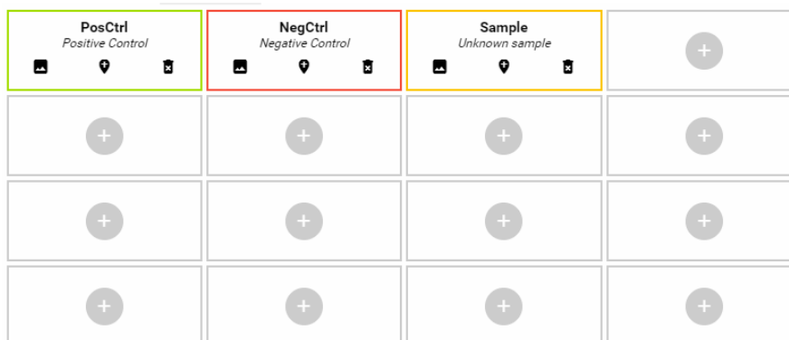
Fig 1. Cartridge set-up

The Kits may require the use of Taq Polymerase enzyme, DNA binding components and fluorochromes/quencher, often registered as trademark by companies. TagMan® is a trademark of Roche Molecular Systems, Inc. FAM™, HEX™ and ROX™ are a trademark of Thermo Fisher Scientific or its subsidiaries. SYBR is a registered trademark of Molecular Probes, Inc. (Thermo Fisher Scientific). MGB probes are a trademark of Elitech group. The Kits have been internally tested by our quality control. Any responsibility is waived if the warranty of quality control does not refer to the specific Kits. The user is personally responsible for data that he/she will obtain and/or he/she will supply to third parties using these kits. Once the sealed package is opened the user accepts all the conditions without fail; if the package is still sealed the kit can be returned and the user can be refunded. Kits components are intended, developed, designed, and sold for Research Purpose Only. Product claims are subject to change. Therefore, please refer to our website (www.hyris.net) for the most up-to-date information on Hyris Ltd products.