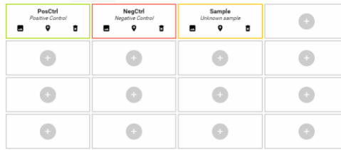
Fig 1. Cartridge set-up

The Kits are intended for Research Use Only.