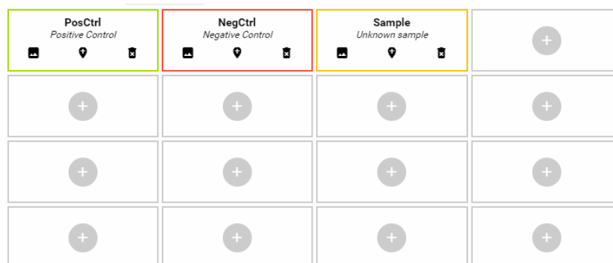
Fig 1. Cartridge set-up

An example of cartridge set-up on the bAPP for one replicate of a sample to be analyzed is shown.