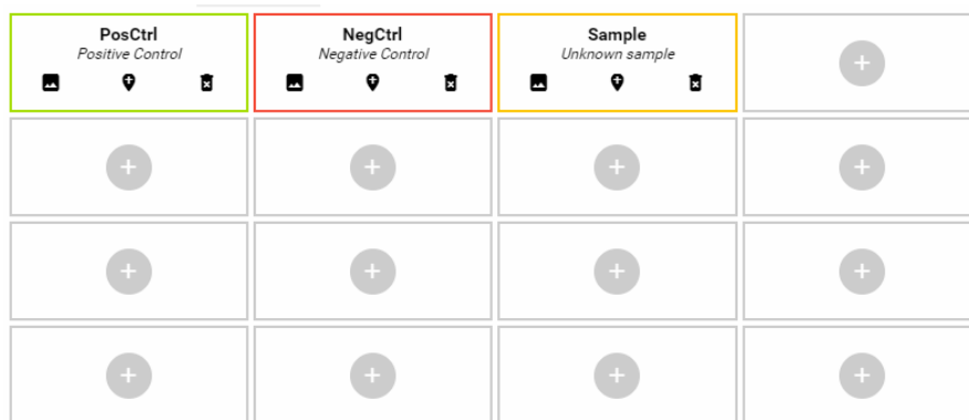
Fig 1. Cartridge set-up

Kits components are intended, developed, designed, and sold for Research Purpose Only. Product claims are subject to change. Therefore, please refer to our website (www.hyris.net) for the most up-to-date information on Hyris Ltd products.